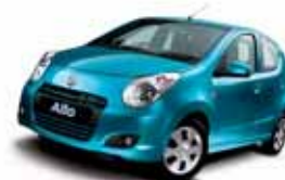
◦ Paradise Blue Pearl Metallic