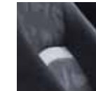
Cruz trim with silver accent