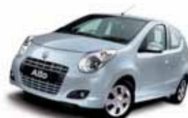
◦ Silky Silver Metallic