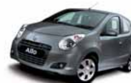
◦ Azure Grey Pearl Metallic