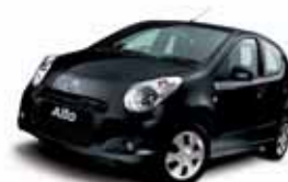
• Midnight Black Pearl Metallic