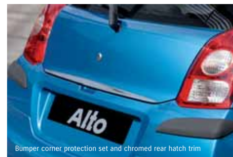
Bumper corner protection set and chromed rear hatch trim