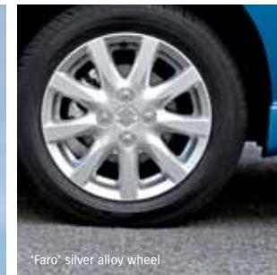
"Faro" silver alloy wheel