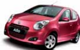
• Fortune Rose Pearl Metallic

The new Alto is a car with a vibrant personality. There are six bold colours that match it. Which one are you?