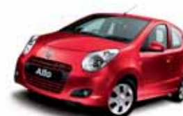
◦ Bright Red

• available with pink accent trim ◦ available with silver accent trim