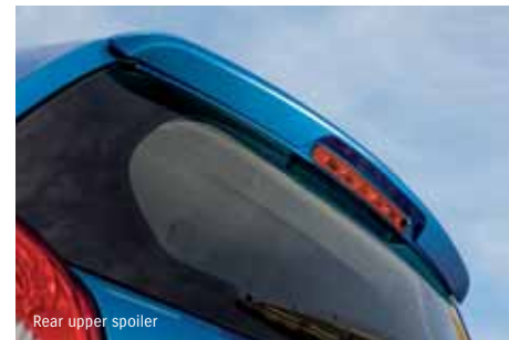
Rear upper spoiler